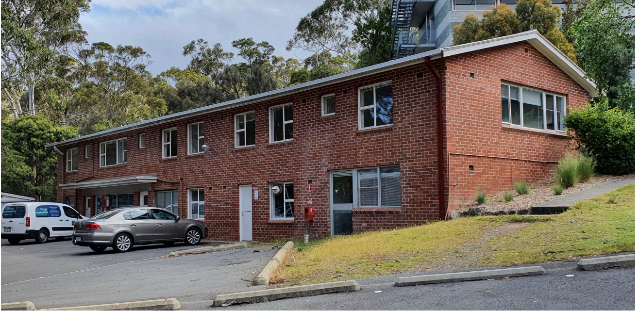
UTAS Old Commerce Building Annex, entry off French Street, Sandy Bay